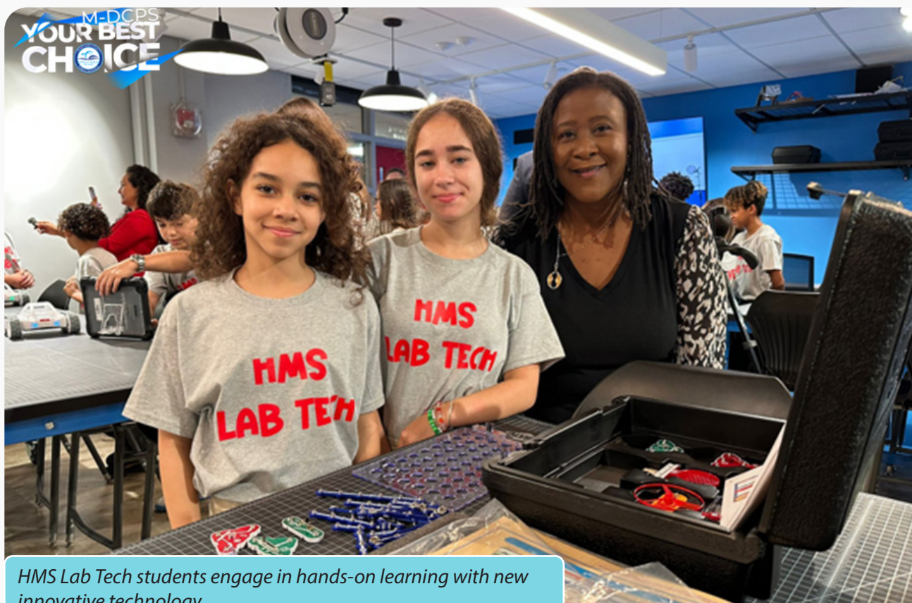
HMS Lab Tech students engage in hands-on learning with new innovative technology.

The Verizon Innovative Learning Lab program is a comprehensive, multi-year initiative that blends immersive technology with project-based curriculum and real-world problem solving, all housed in custom-designed Innovation Labs within school buildings. The program represents a collaboration between Verizon, Heart of America, and the J. Orin Edson Entrepreneurship + Innovation Institute at Arizona State University.