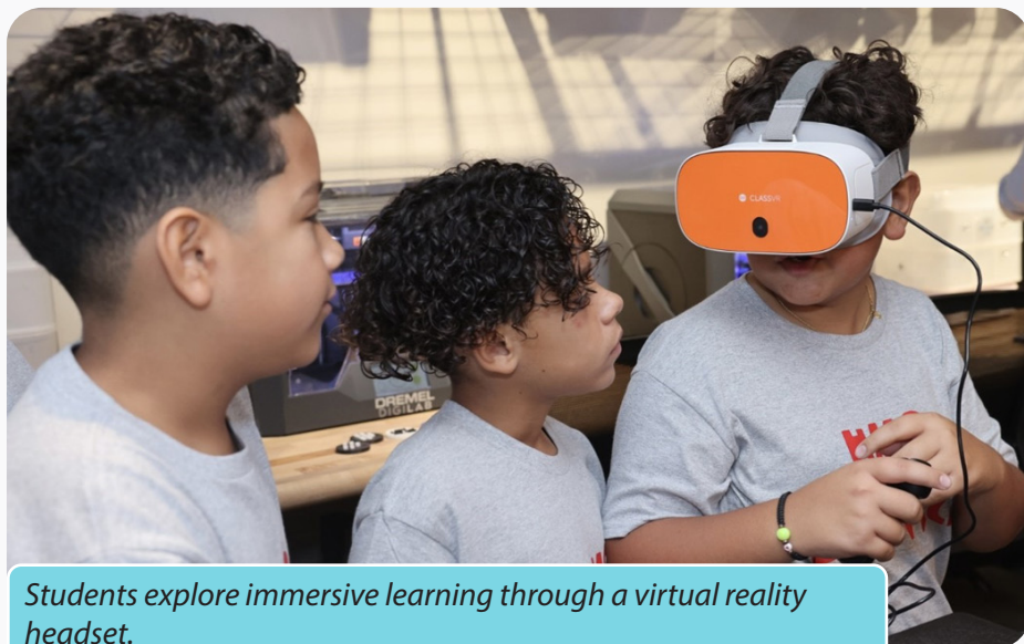
Students explore immersive learning through a virtual reality headset.

Miami-Dade County Public Schools (M-DCPS) celebrated the opening of state-of-the-art Verizon Innovative Learning Labs at three middle schools during a ribbon-cutting ceremony on November 13, 2025, held at Hialeah Middle School. The new labs at Homestead Middle School, Hialeah Middle School, and John F. Kennedy Middle School are outfitted with virtual reality headsets, programmable robots, 3D printers, and other advanced technology designed to prepare students for an increasingly tech-driven world.