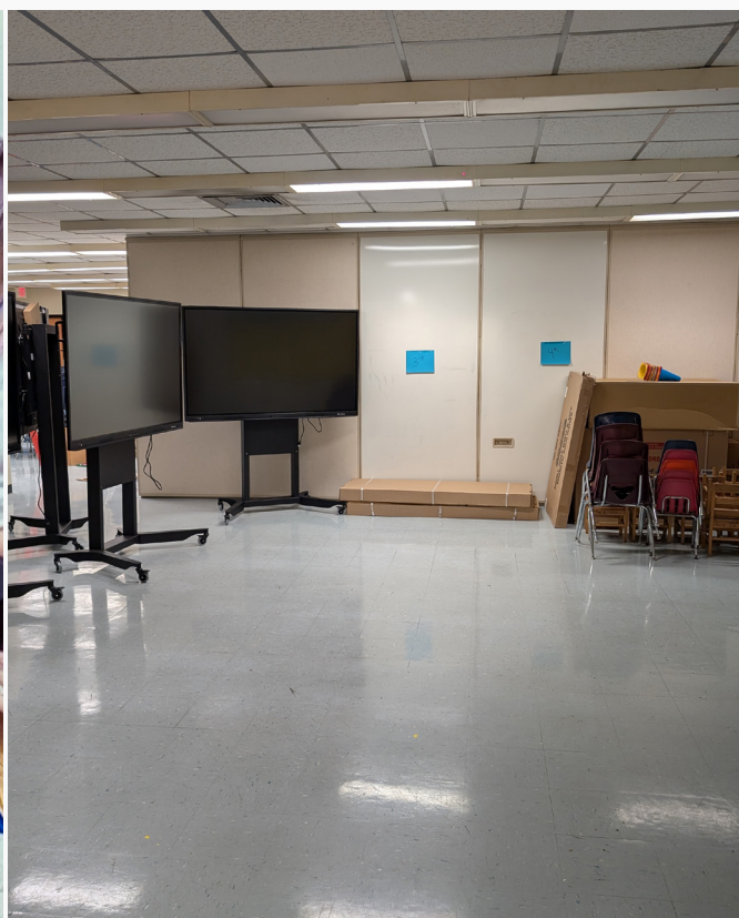
Space being prepared to be converted into science lab.