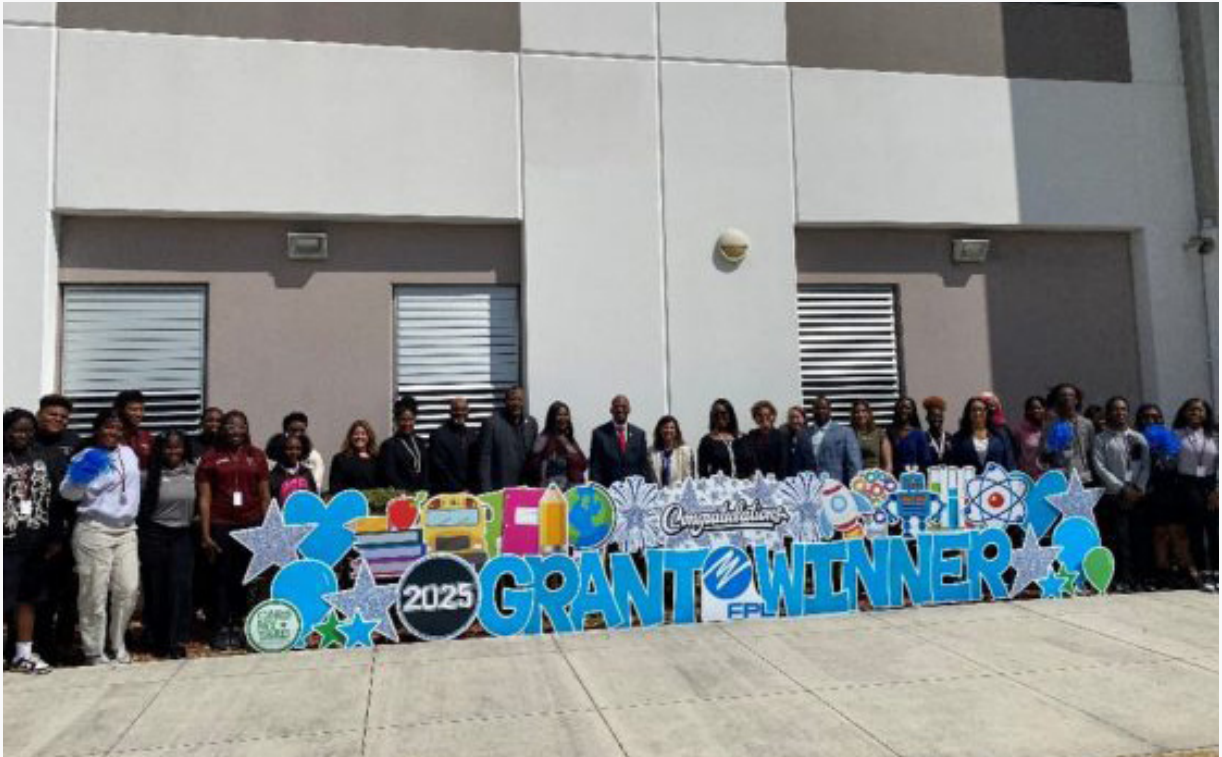
Miami Norland Senior High School

The funding will allow schools to purchase state-of-the-art educational technology and resources including virtual reality equipment, 3D printing stations, robotics kits, interactive learning displays, and collaborative workspaces.