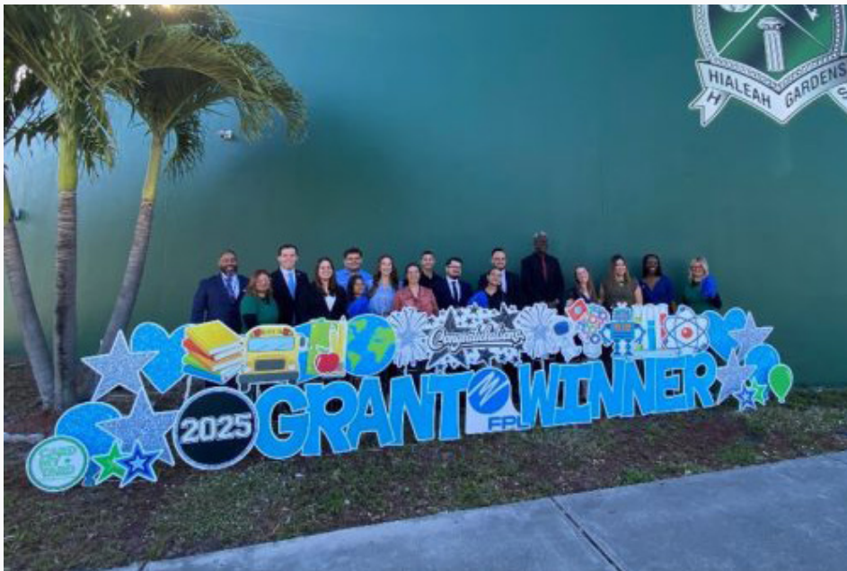
Hialeah Gardens Senior High School

F lorida Power & Light Company (FPL) has significantly expanded its educational outreach by quadrupling its Science, Technology, Engineering, and Mathematics (STEM) Classroom Makeover Grant program, now offering $1 million in funding to benefit students across Florida. The initiative, which previously supported five schools, will now reach 20 educational institutions statewide, marking a substantial growth in the company's commitment to STEM education.