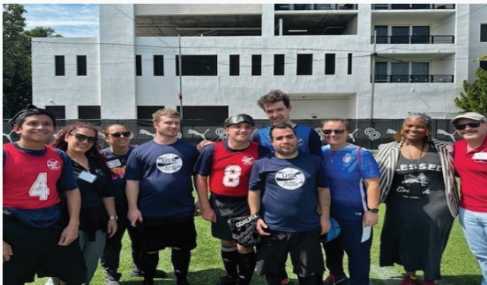
M-DCPS staff promotes physical fitness and teamwork at kickoff pilot program event.