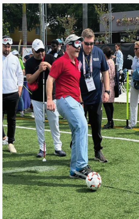
M-DCPS staff trains over the summer and hosts an inclusion kickoff event to launch the pilot program.

Mimi-Dade County Public Schools (M-DCPS), was recently awarded a $25,000 grant from Bridgestone Americas, Inc. to support the Blind Soccer Initiative. This transformative program empowers visually impaired students, fosters inclusive communities, and cultivates skills for lifelong success for all participants. The pilot program will expand in 2026 to 66 schools directly impacting approximately 57,800 students. This $25,000 grant award will help build a program that can open doors for students to participate in organized competitive sports at regional and national competitions, potentially paving the way to scholarships and pathways to the Paralympics in 2028.